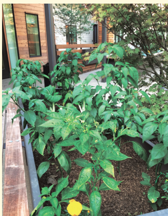
One of the raised gardens at Abe's Garden.