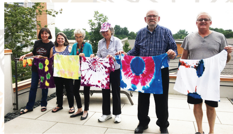
Abe's Garden® Community Group (AGCG) participants channeled their inner hippie during a "Summer of Love" tie-dye activity.