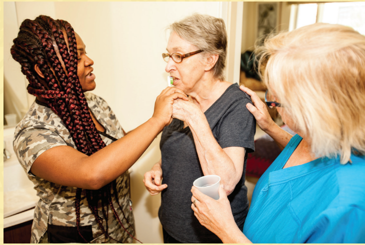
Mouth care is one of the activities of daily living addressed in AHAG training.