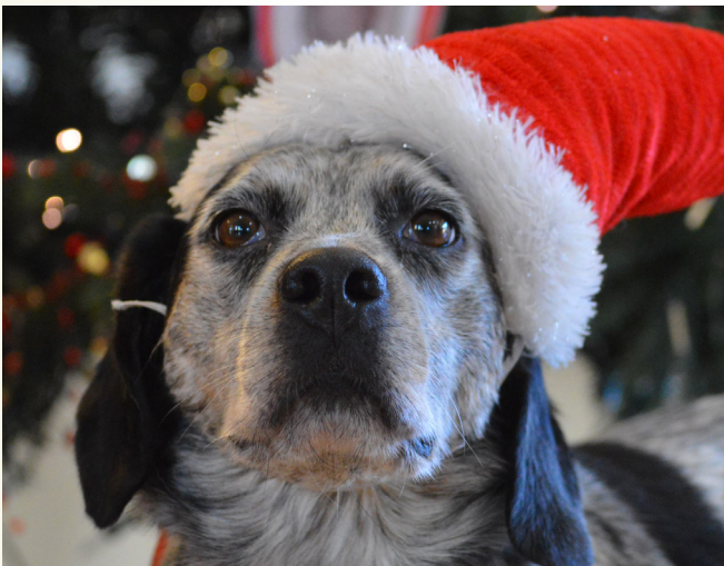
Thanks to Kelly Clarkson, Brady is Abe's Garden's new therapy pet.