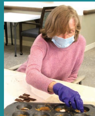
An Abe's Garden® resident and culinary club member happily creates s'mores cups to share with her neighbors.