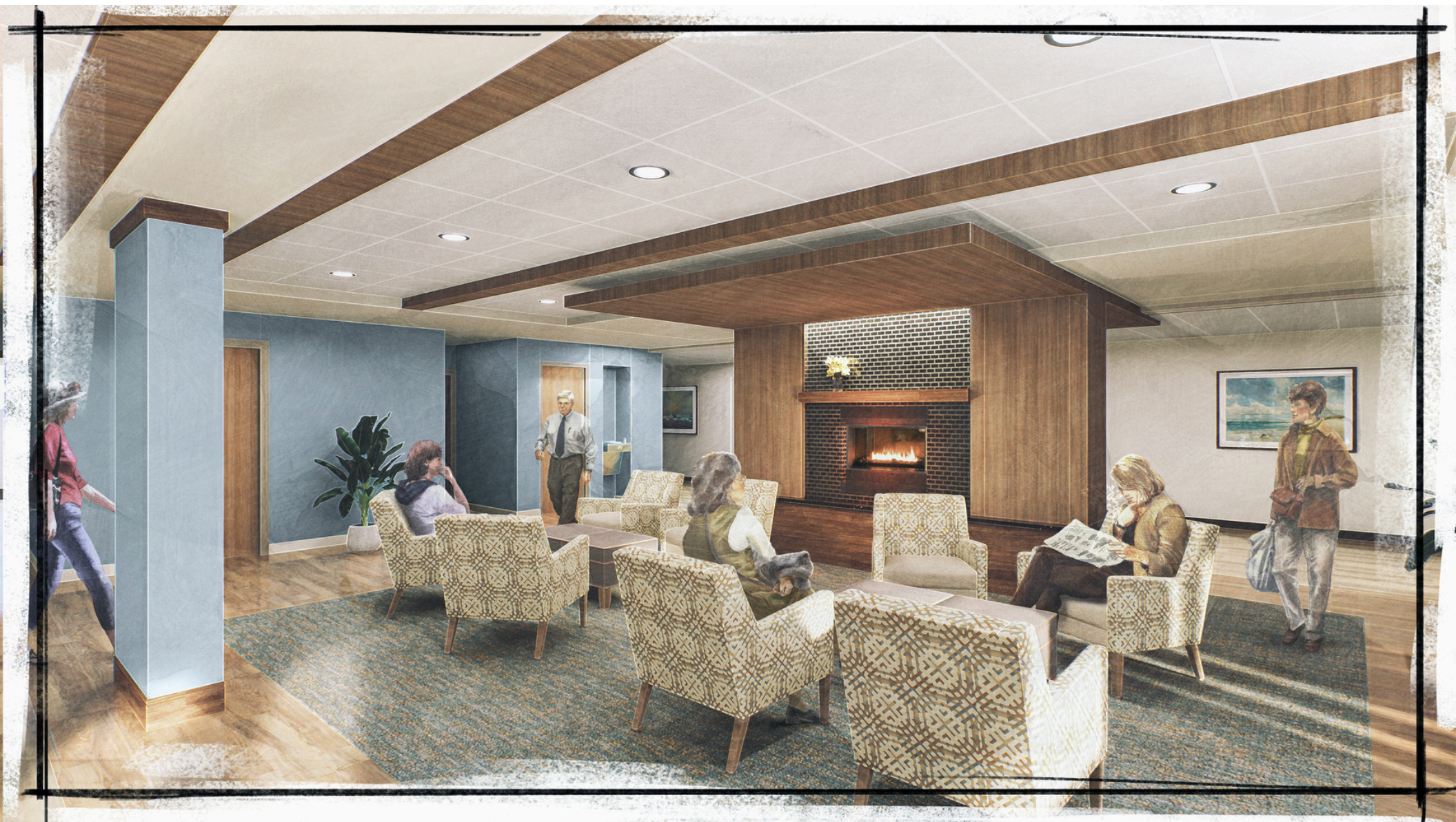
Bistro Hearth (Naming Available)