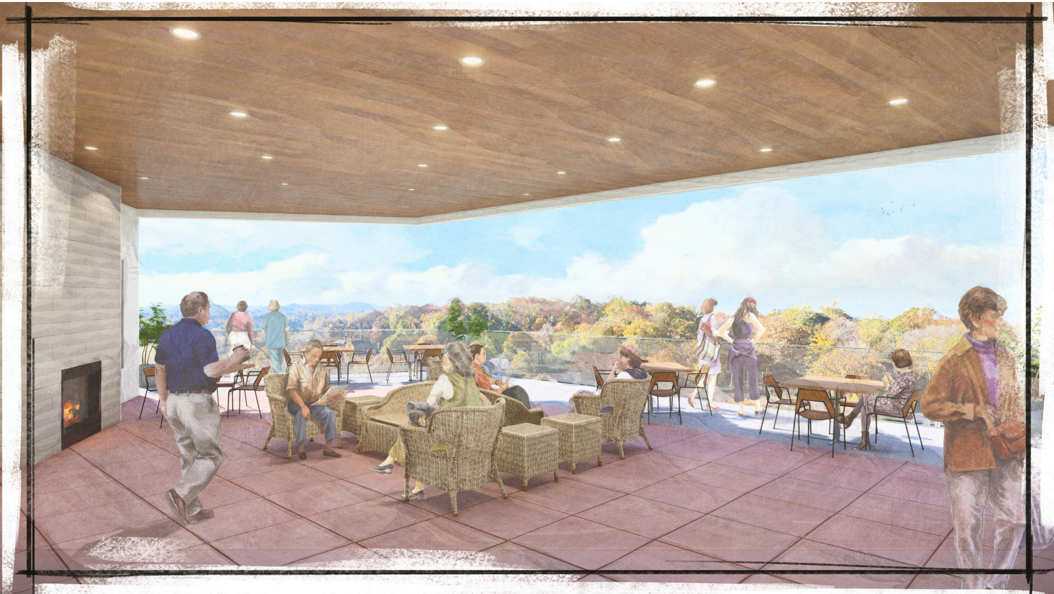
Terrace (Naming Reserved)