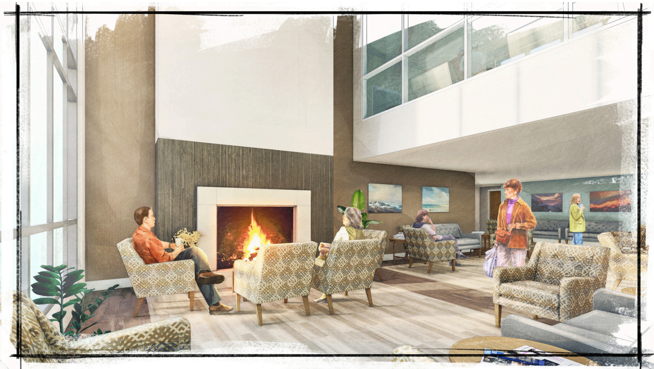
Memory Support Hearth (Naming Available)