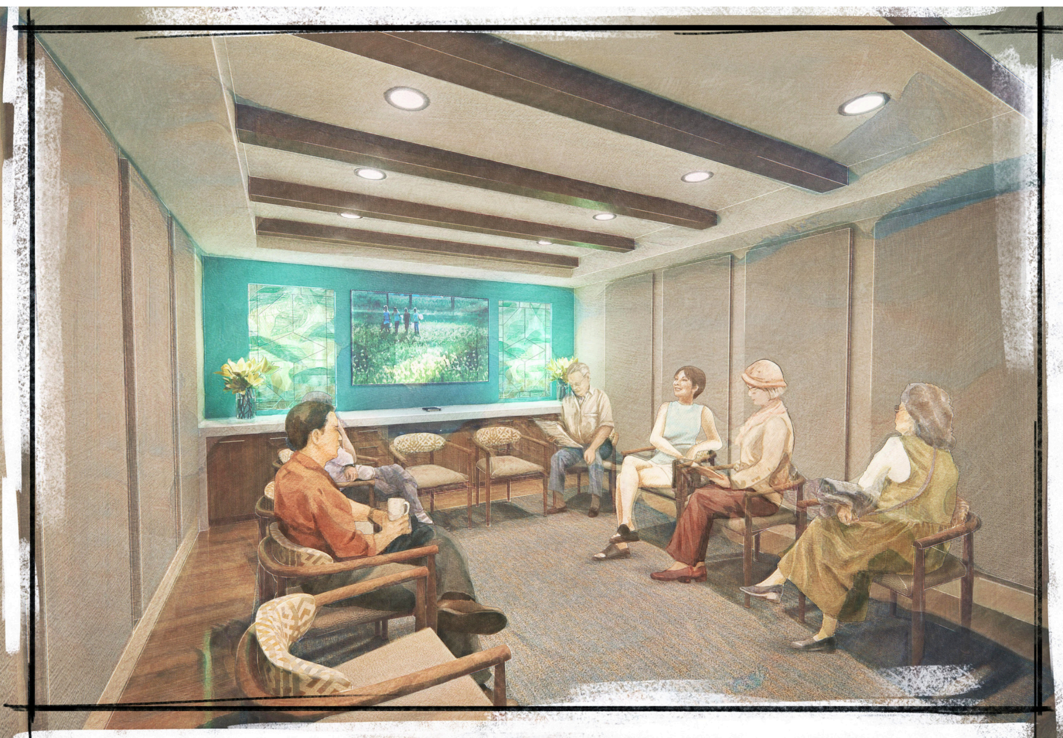
Chapel (Naming Reserved)