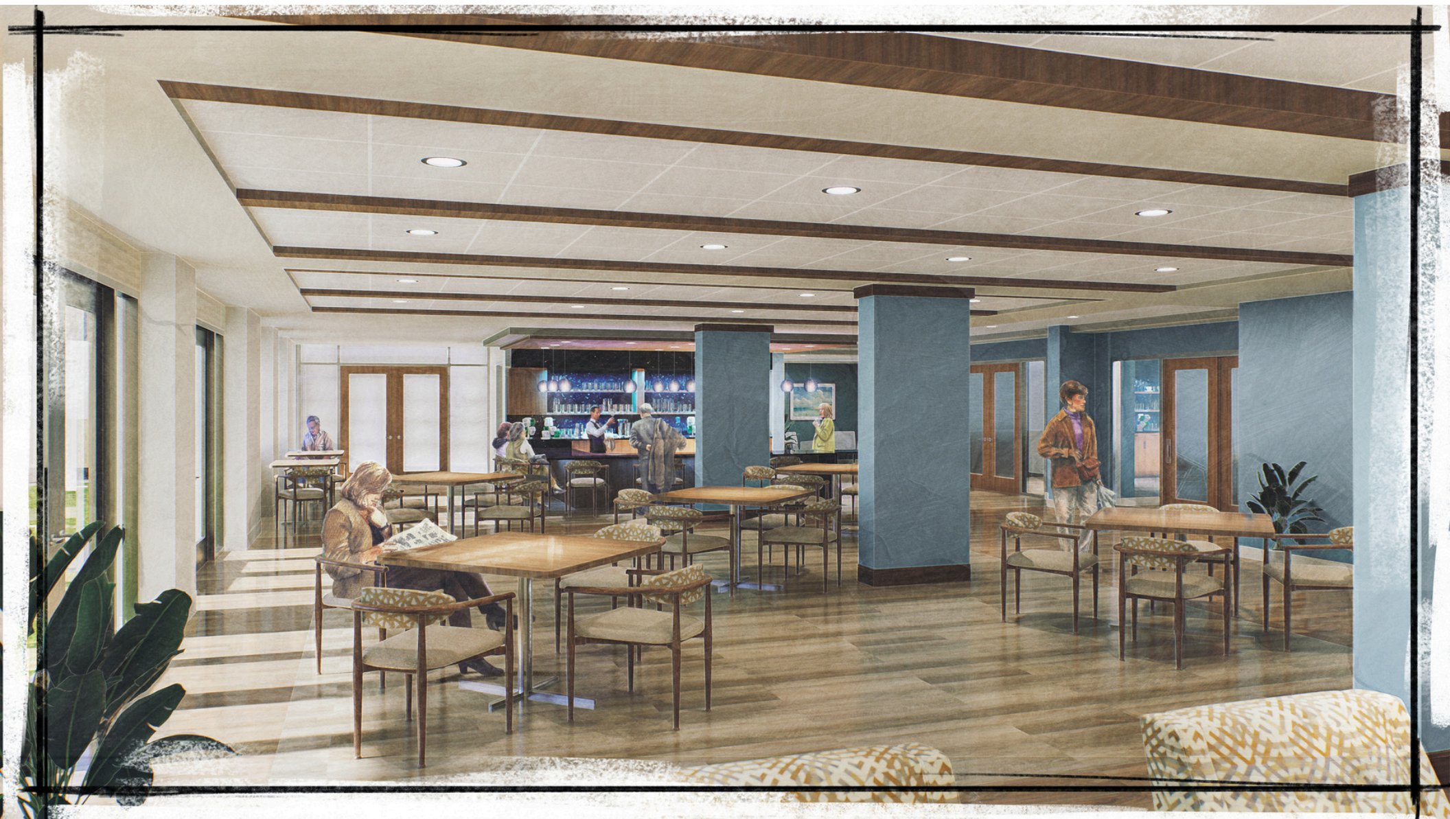
Bistro Dining (Naming Available)