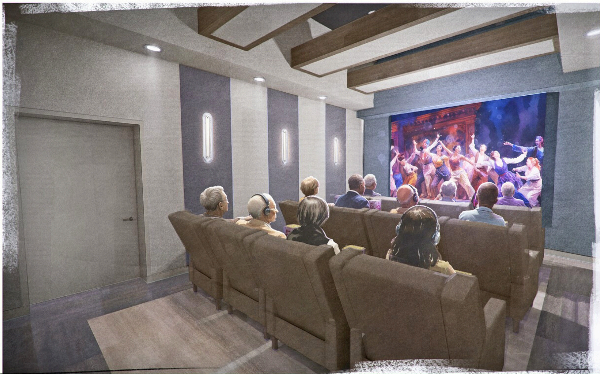
Theater & Music Therapy Lab (Naming Reserved)