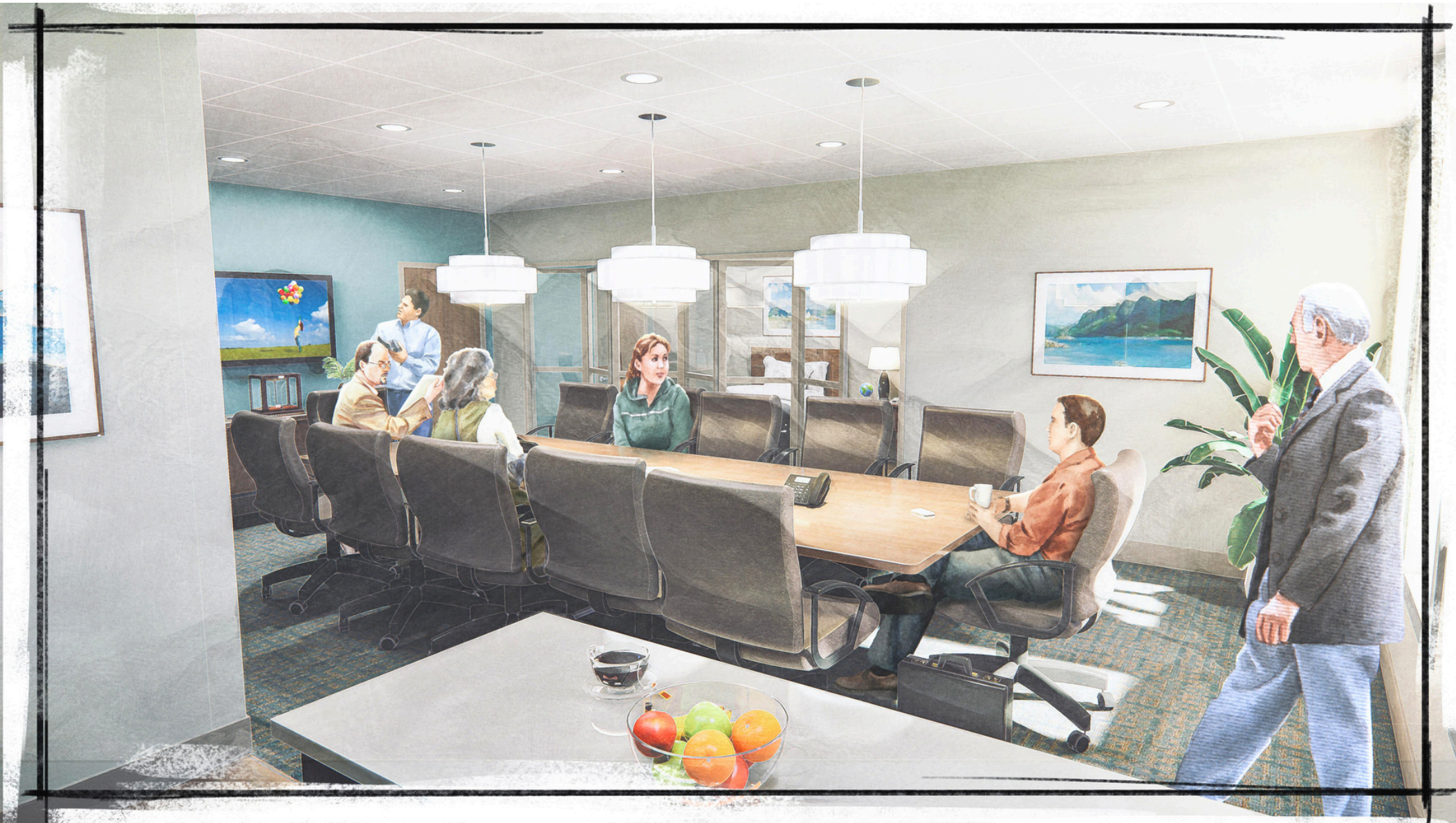
Education & Training Suite (Naming Available)