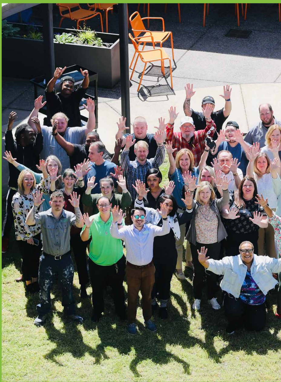
Members of our dedicated, compassionate staff celebrating a decade of

A Decade (And More!) of Dedication These committed team members have served our community for 10 years or more, building lasting relationships every step of the way.